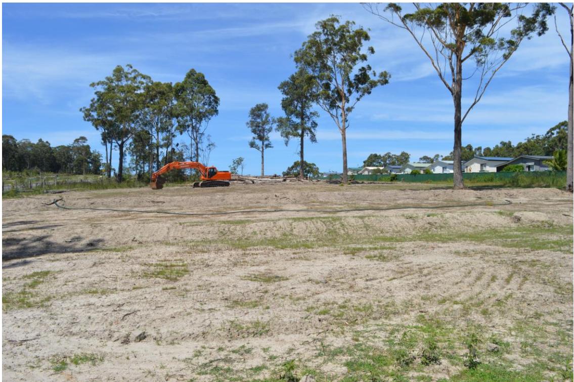
Photograph 4. View looking east across the land on the southern side of Anson Street.