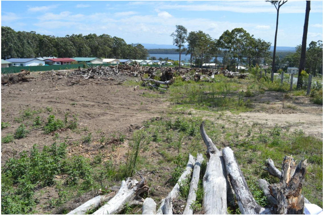
Photograph 3. View looking west across the land on the southern side of Anson Street.