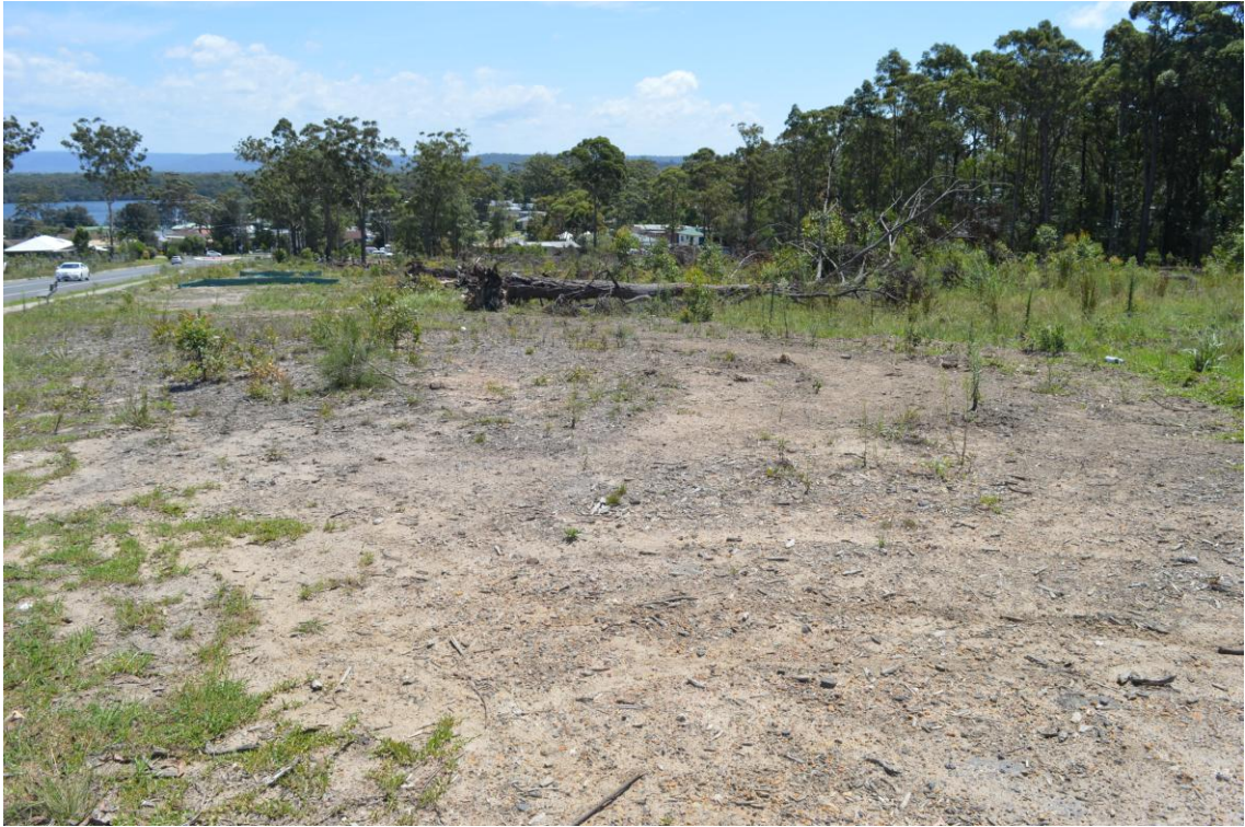
Photograph 1. View looking west across the land on the northern side of Anson Street.