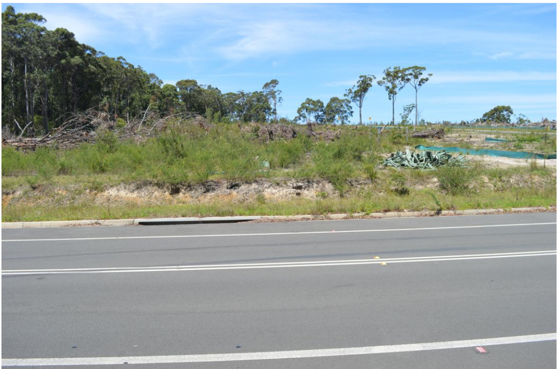
Photograph 2. View looking east across the land on the northern side of Anson Street.